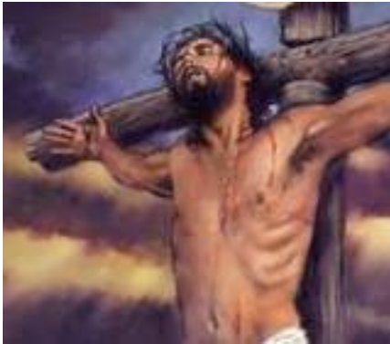
“I am thirsty” John 19:28

Now, when we read about Yahshua MessiYah, we can understand (and discern) His dual nature as a man made of flesh , and our “Everlasting Father” . (Isaiah 9:6)