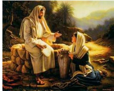
Yahshua gives living water John 4:14

Many fail to comprehend that The Almighty Father can be in Heaven filling the universe with His majesty and yet, at the same time , He can manifest His glory among us in the tent of a human body .